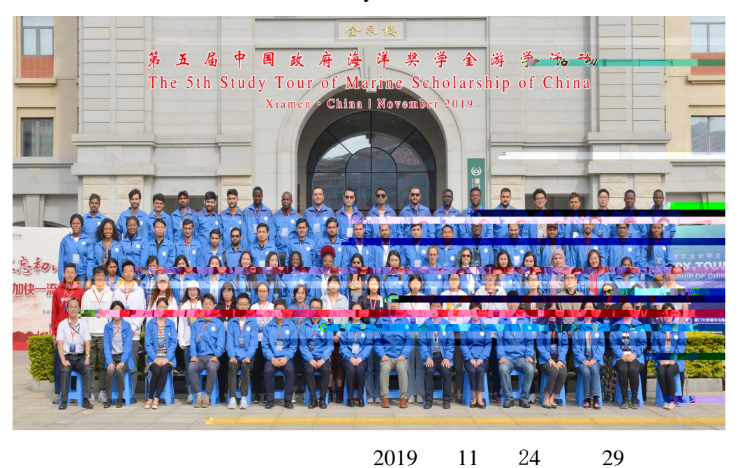
Group photo of 5<sup>th</sup> Marine Scholarship of China exchange program, Nov. 24 to 29, 2019, Xiamen University