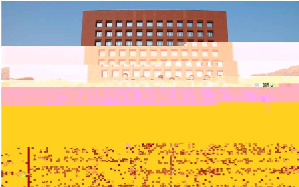
Group photo of 1 st Marine Scholarship of China exchange program, Nov. 9 to 13, 2015, Beijing