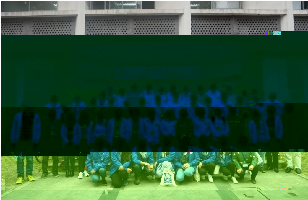
Group photo of 2 nd Marine Scholarship of China exchange program, Dec. 5 to 8, 2016, Zhejiang University