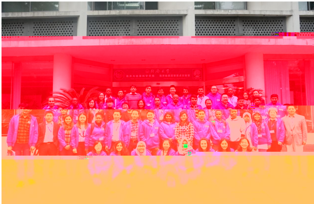
Group photo of 2 nd Marine Scholarship of China exchange program, Dec. 5 to 8, 2016, Zhejiang University