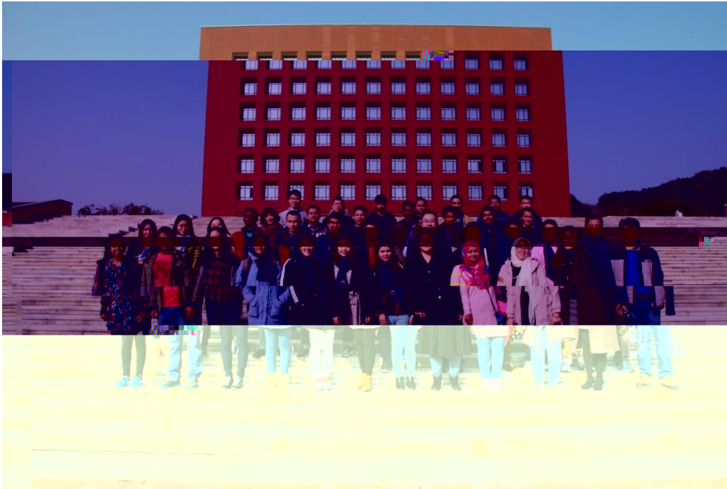
第二届中国政府海洋奖学金游学活动合照，2016 年 12 月 5 日至 8 日，浙江大学

Group photo of 2 nd Marine Scholarship of China exchange program, Dec. 5 to 8, 2016, Zhejiang University