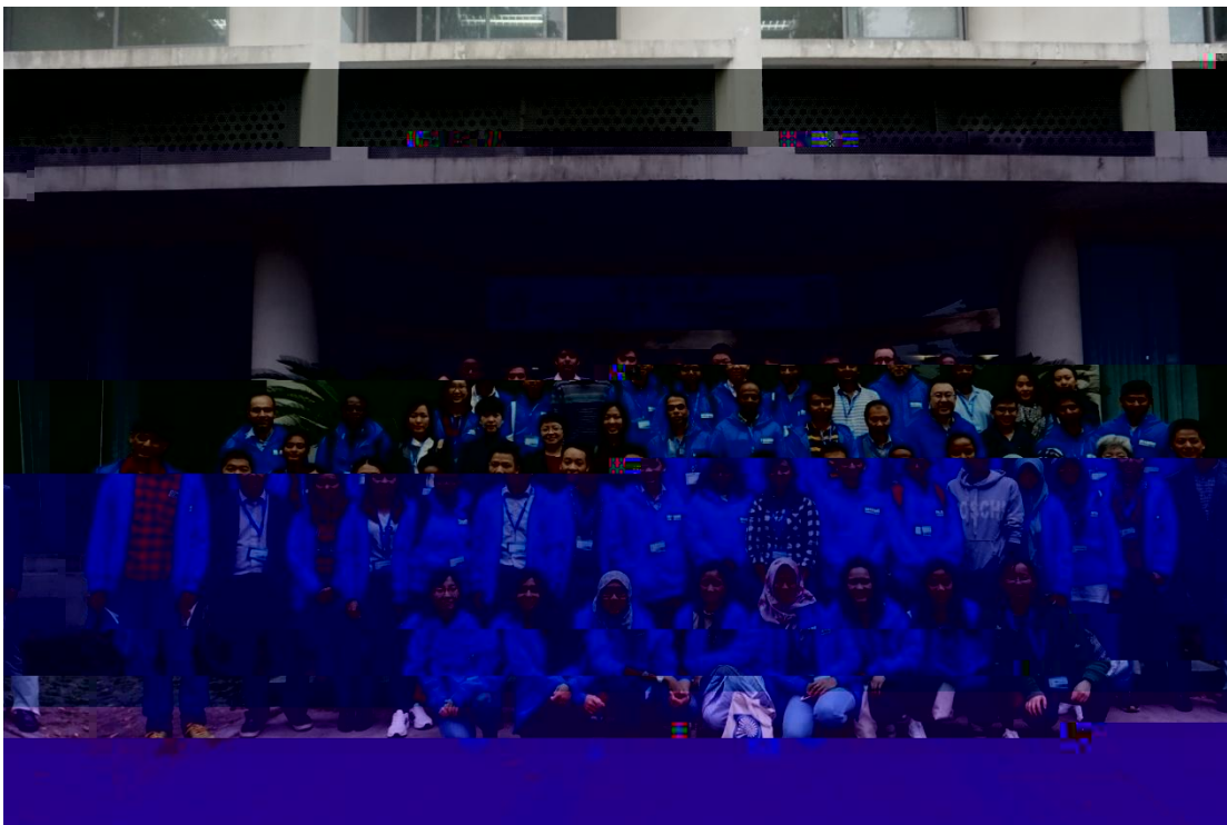
第三届中国政府海洋奖学金游学活动合照，2017 年 11 月 13 日至 16 日，同济大学

Group photo of 2 nd Marine Scholarship of China exchange program, Dec. 5 to 8, 2016, Zhejiang University