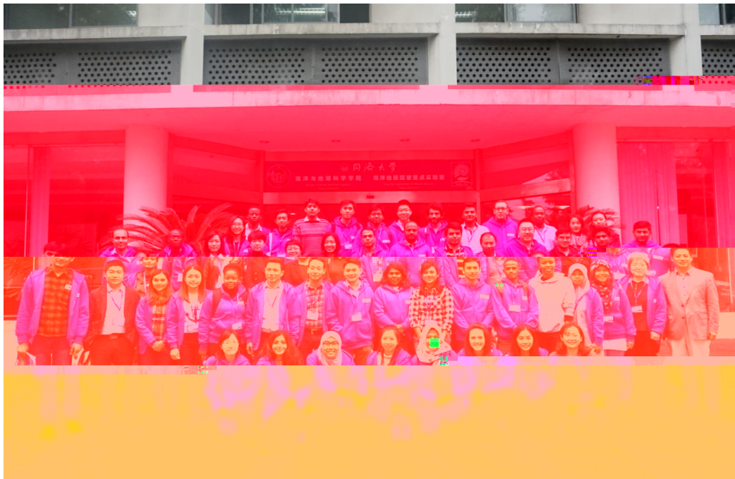
Group photo of 2 nd Marine Scholarship of China exchange program, Dec. 5 to 8, 2016, Zhejiang University