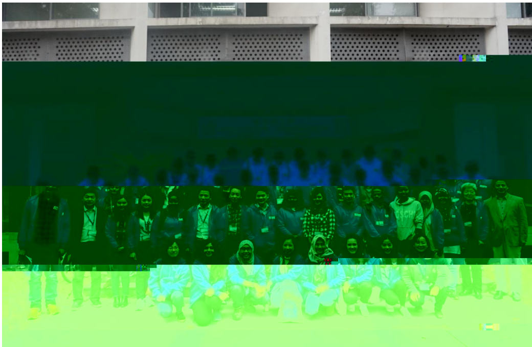
Group photo of 2 nd Marine Scholarship of China exchange program, Dec. 5 to 8, 2016, Zhejiang University