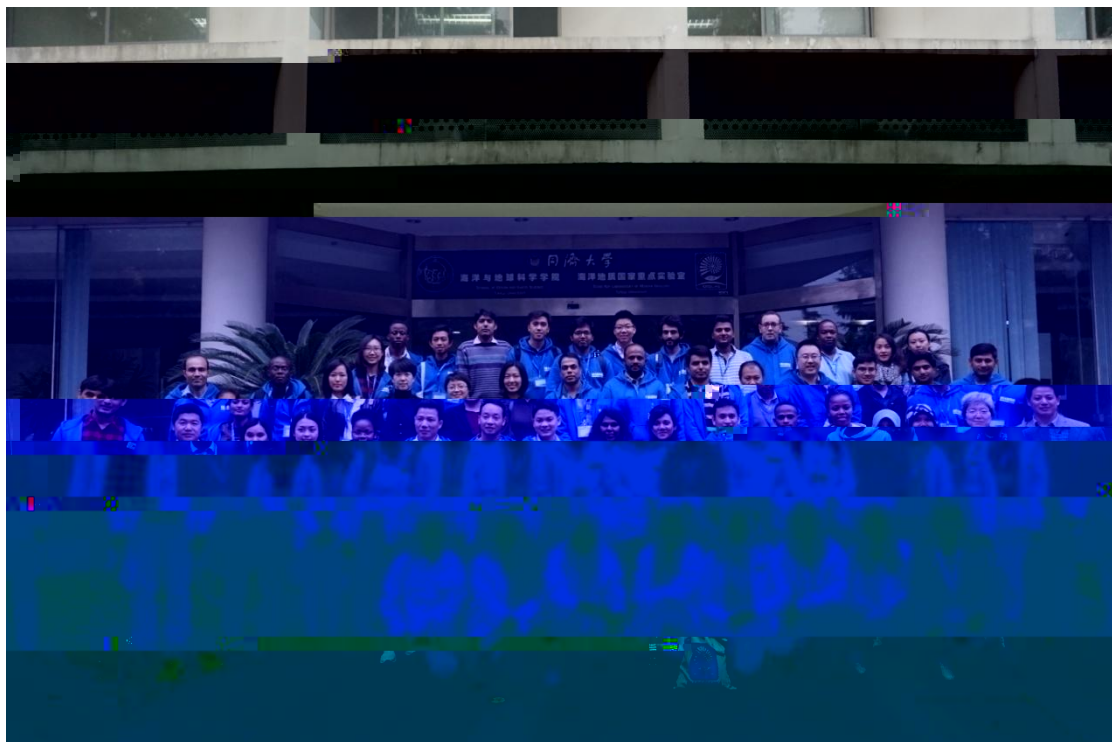
Group photo of 2 nd Marine Scholarship of China exchange program, Dec. 5 to 8, 2016, Zhejiang University